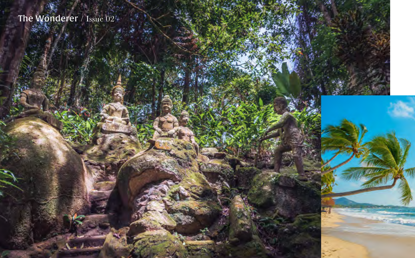
▲ Tarnim Magic Garden