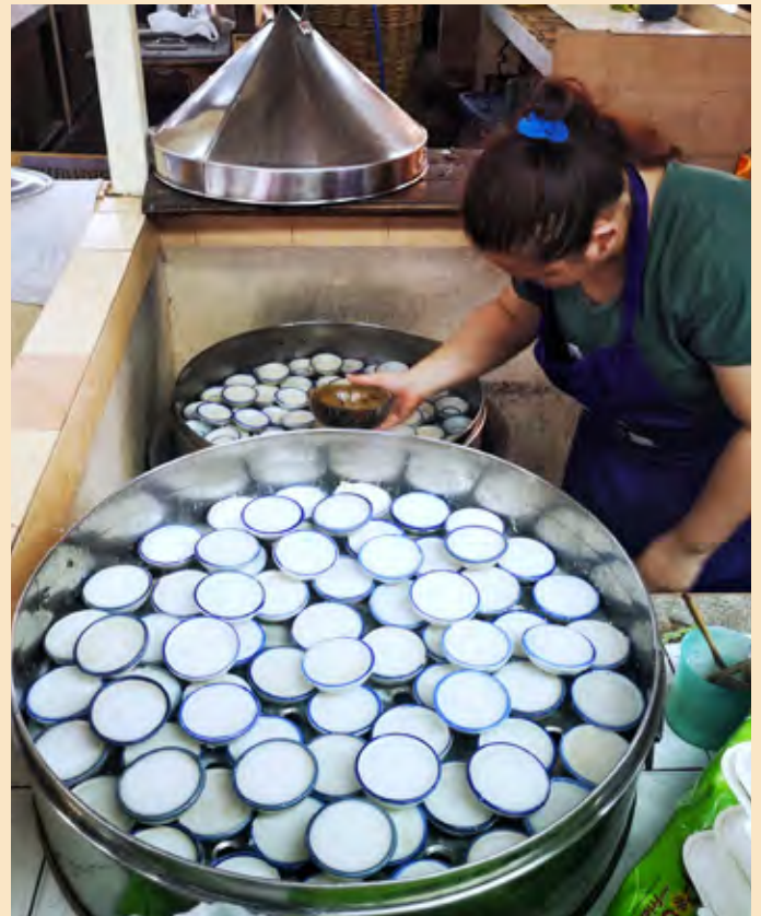
Kanom Tuay or steamed coconut dessert at Nang Loeng Market ▼

To make things easier, we've crafted a handful of one-day itineraries to help you explore Bangkok's many layers—from off-the-beaten-path neighbourhoods and historic sites to vibrant art scenes and bold flavours. Step away from your meetings and discover the cultural treasures that make this city truly unforgettable—experiences that go well beyond business.