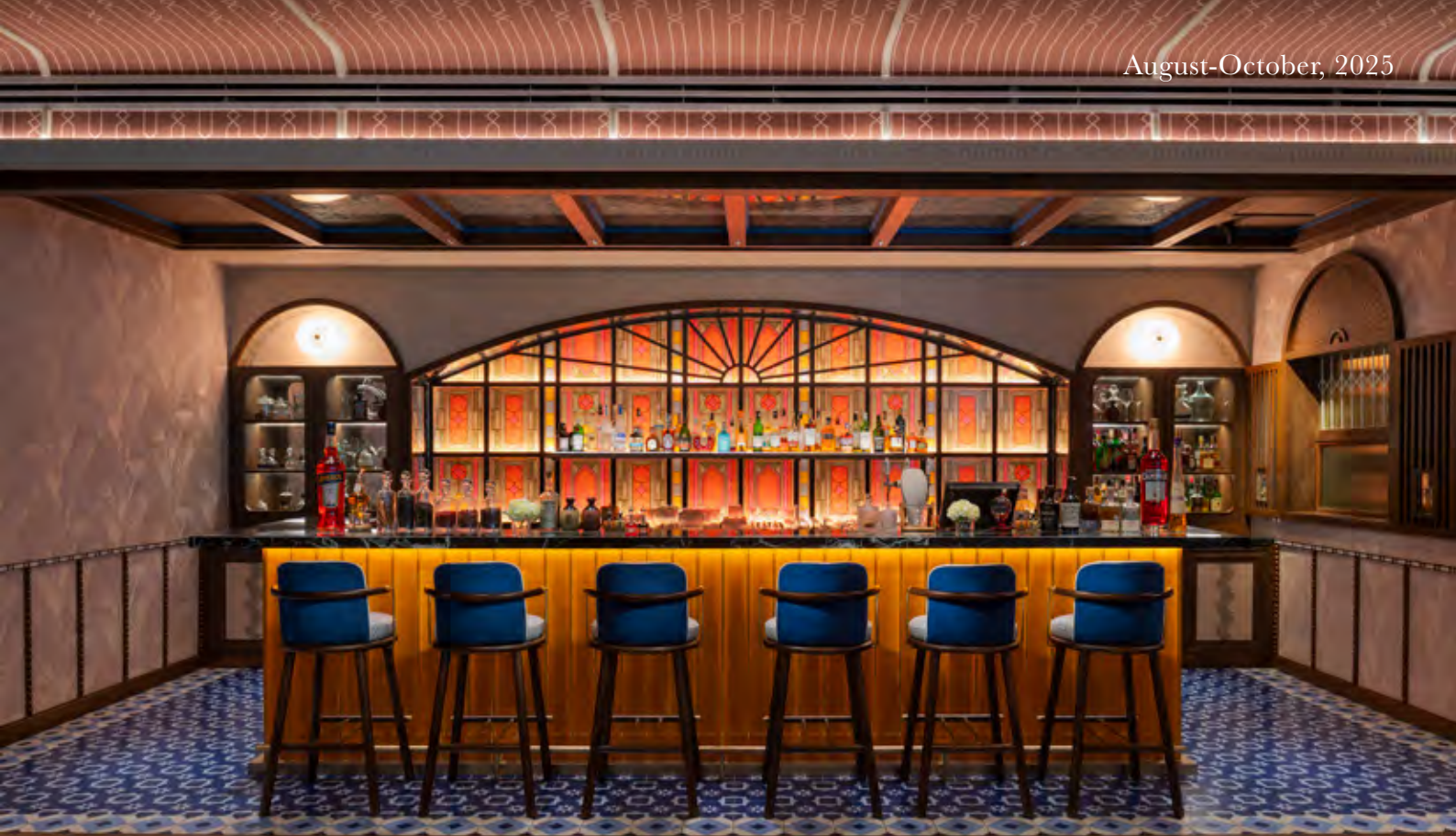
Nila at Amari Bangkok