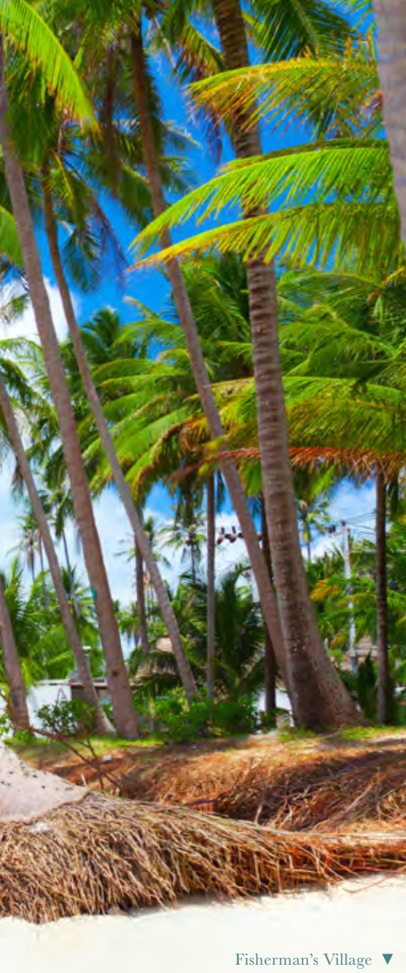
Fisherman's Village ▼