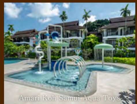
Amari Koh Samui Aqua Toys

We're thrilled to announce the expansion of Maitree Bar, with four new locations opening at Amari Bangkok, Amari Bangsaen, Amari Vientiane, and Amari Hua Hin. Maitree, meaning "friendship" in Thai, perfectly captures the concept of these vibrant lobby bars: offering elevated Thai street food favourites in a relaxed setting. We're committed to sustainability, sourcing all ingredients from within Thailand. Look out for our signature aromatic Thai tea, plus a unique DIY Matcha drink experience at each location, with recipes crafted by local mixologists. Maitree Bar is your ideal spot to unwind and enjoy authentic Thai flavours.