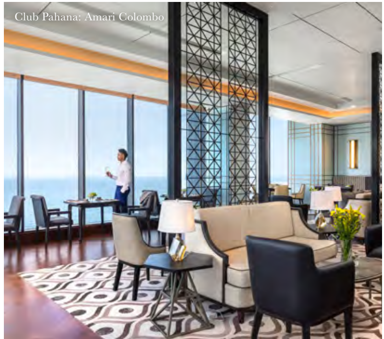
Club Pahana: Amari Colombo

These five Asian breakfasts offer a delightful departure from the humdrum, showcasing the incredible diversity and culinary richness of the continent. So, the next time you're planning your morning meal, consider stepping out of your comfort zone and indulging in one of these delicious and truly unforgettable Asian breakfast experiences. Fancy giving one of these a whirl?