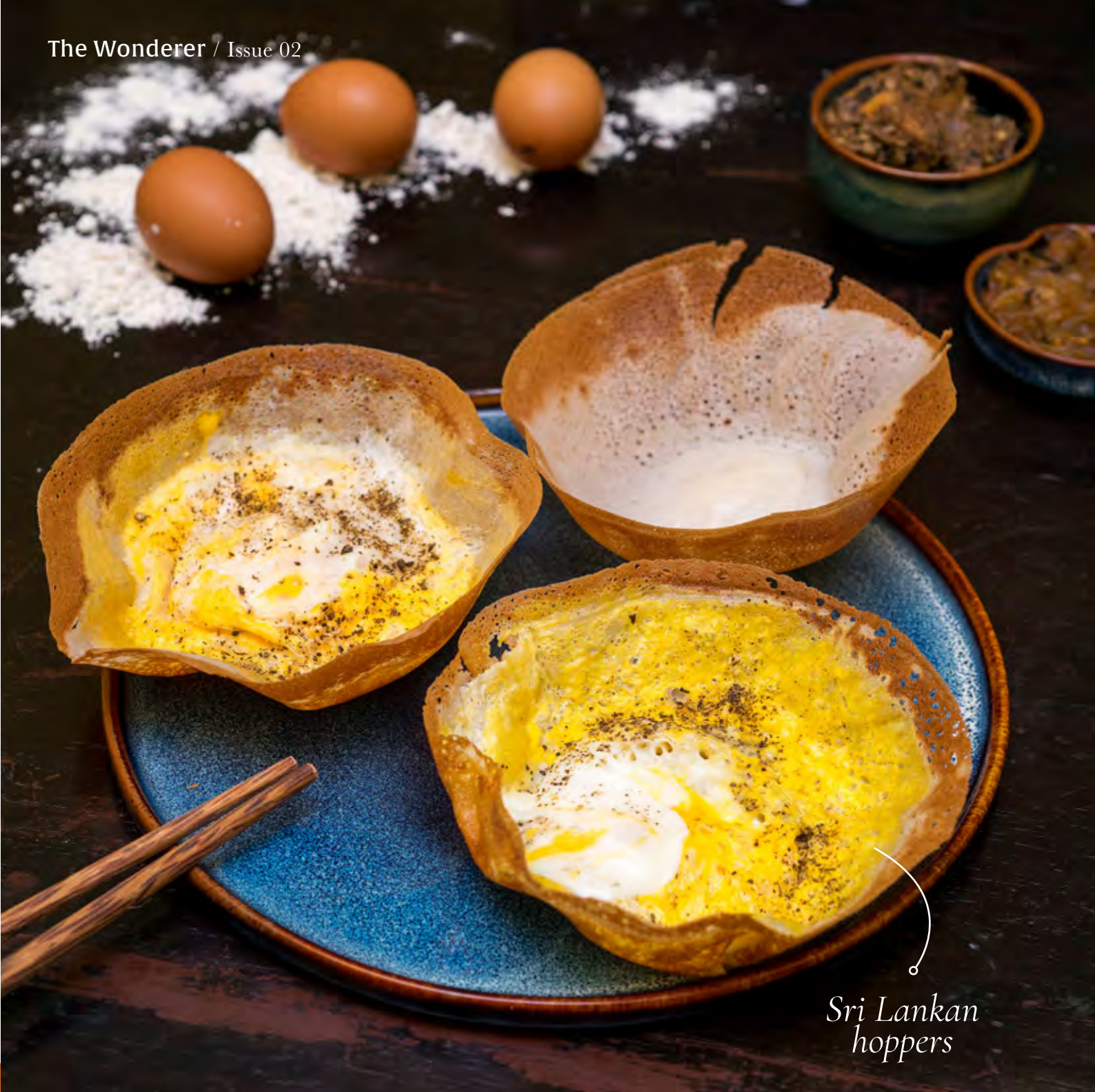
Sri Lankan hoppers